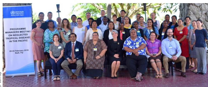
Group photo of the Programme Managers Meeting on Neglected Tropical Diseases in the Pacific in Nadi, Fiji on 20-22 February 2018

The Programme Managers Meeting on Neglected Tropical Diseases in the Pacific was held in Nadi, Fiji on 20-22 February 2018. The meeting was attended by 26 participants from 16 countries in the Pacific, 3 temporary advisors and representatives from 5 partner agencies. The meeting discussed the draft Regional Framework for Control and Elimination of NTDs, new WHO tools and guidelines, various country experience and challenges and regional priorities and support needed to accelerate elimination and control of NTDs in the Pacific. The particular focus was on the new WHO recommendation on triple drug therapy for elimination of LF, post-validation surveillance, morbidity management and disability prevention associated with LF, strengthening data reporting and control of scabies.