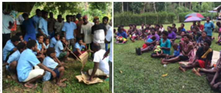
Community health education workshops in Espiritu Santo, Sanma province on World Malaria Day, 23-27 April 2018

A total of 1826 scabies cases were reported through the HIS reporting system, whereas 23 scabies cases were diagnosed and treated as part of NTD surveillance integrated with activities on World Malaria Day in selected communities in Sanma and Shefa provinces.