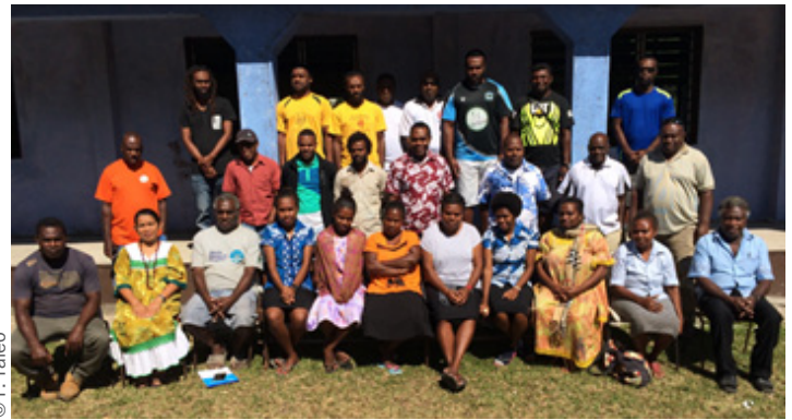
National NTD Planning Meeting at Mangaliliu village, Port Vila, March 2018