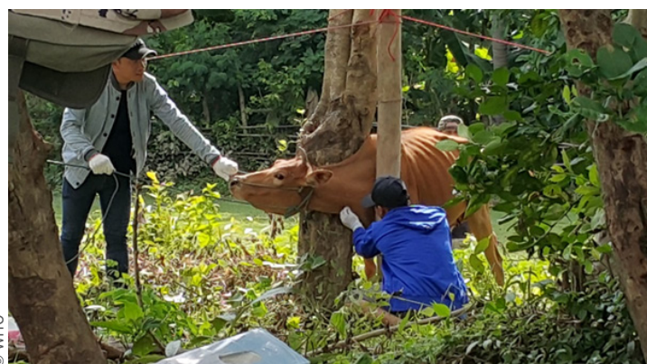
Collection of blood and faecal samples from potential animal reservoirs to assess schistosomiasis infection in Champasak province, June-August 2018

The schistosomiasis infection survey in potential animal reservoirs, including goat, dog, pig, buffalo, and cow, was initiated in June 2018 and is expected to continue to August 2018 in seven sentinel villages in Champasak province. The survey was led by the Institut Pasteur du Laos in collaboration with the Ministry of Agriculture and Forestry and with the support of WHO.