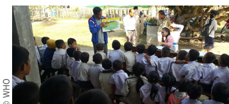
Health education activity for school children during the integrated MDA for schistosomiasis and soil-transmitted helminthiasis in Champasak province, 15 - 17 February 2018

A two-day training course for outreach teams from the health and education sectors in preparation for implementation of integrated MDA for schistosomiasis and STH, using a combination of praziquantel and mebendazole in six pilot sentinel villages, was carried out from 13 to 14 February 2018. The training was followed by implementation of MDA from 15 to 17 February 2018.