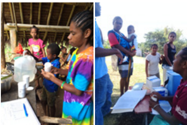
Integrated deworming and yaws surveillance in Sanma and Shefa provinces, May 2018