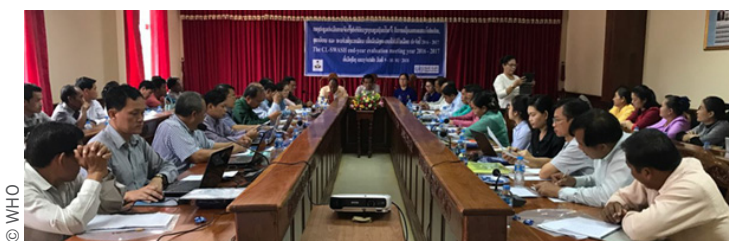
Evaluation meeting of CL-SWASH in Pakse, Champasak province 9-10 January 2018

A meeting to evaluate implementation of the Community-led initiative to eliminate Schistosomiasis with Water, Sanitation and Hygiene (CL-SWASH) after its launch in 2016 was held by the National Center for Environmental Health and Water Supply (Namsaat) working under the Ministry of Health, in Pakse, Champasak province, from 9 to 10 January 2018. The objective of this meeting was to review the achievements and challenges in implementing CL-SWASH in 24 villages since November 2016. Participants included the Department of Communicable Disease Control (DCDC), the Centre for Malariology, Parasitology and Entomology (CMPE), Namsaat, Champasak Provincial Health Department, the provincial malaria station, provincial Namsaat, district governor, and representatives from 10 villages where CL-SWASH has been implemented. The report is being compiled.