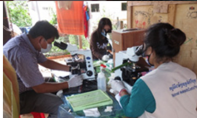
Investigation of the burden of intestinal trematode infection in schoolchildren and residents in Preah Vihear and Stung Treng provinces, Cambodia, May 2018