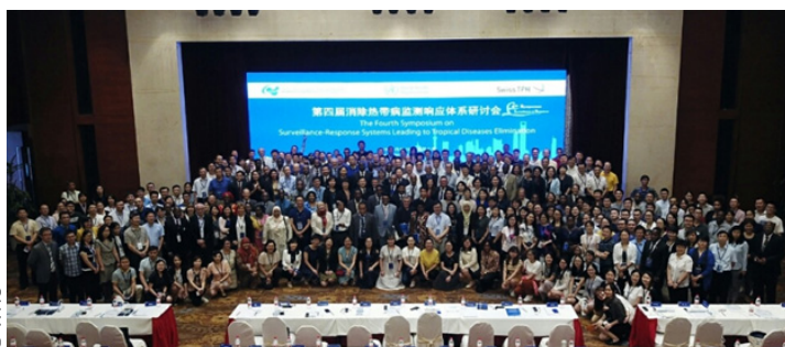
Fourth Symposium on Surveillance-Response Systems Leading to Tropical Disease Elimination, Shanghai, China, 25-26 June 2018