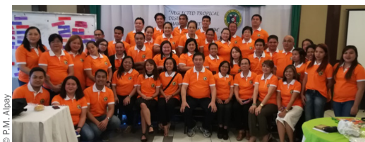
NTD-MIS training in Cagayan de Oro City (Region 10), 22-23 March 2018

The Disease Prevention Control Bureau (DPCB) and Regional Office 8 of DOH forged a Memorandum of Agreement (MOA) with the Bureau of Animal Industry (BAI) and Regional Agricultural Office 8 of the Department of Agriculture (DA). Under this agreement, the DA-BAI and Regional Agriculture Office 8 will lead the implementation of a demonstration project on the control and prevention of animal schistosomiasis under the “One Health Approach” in one of the endemic provinces in Region 8. Results of this project will be the basis of the formulation of a national policy by DA in control and prevention of animal schistosomiasis in the country. It is expected that the project will start in the third quarter of 2018.