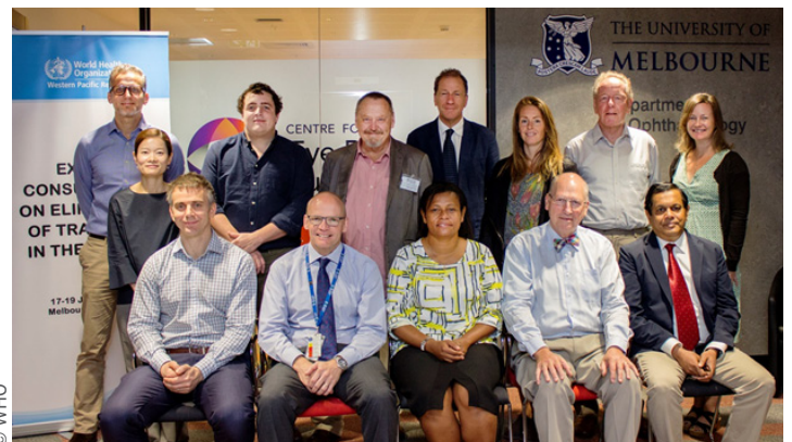
Group photo of the Expert Consultation on the Elimination of Trachoma in the Pacific in Melbourne, Australia, on 17-19 January 2018

The Expert Consultation on the Elimination of Trachoma in the Pacific was held on 17-19 January 2018 at the Centre for Eye Research Australia, University of Melbourne, Australia, to review the outcomes of the post-intervention impact surveys in Solomon Islands and Vanuatu and discuss immediate and medium-term actions and priorities to accelerate elimination of trachoma as a public health problem from the Pacific. Consultation participants acknowledged progress made in the Pacific, including the contribution of trachoma elimination activities to strengthen local health systems and research capacity in the area of eye health and recommended a series of country-specific programmatic actions to accelerate elimination of trachoma in the Pacific.