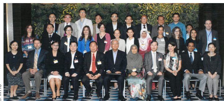
Group photo of the Programme Managers Meeting on Neglected Tropical Diseases in the Asia sub-Region in Manila, Philippines on 13-14 March 2018

The Programme Managers Meeting on Neglected Tropical Diseases in the Asia sub-Region was held in Manila, Philippines on 13-14 March 2018. The meeting was attended by 14 participants from 8 countries in the Asia sub-Region, 6 temporary advisors and representatives from 2 partner agencies. The meeting discussed the way forward for accelerating control and elimination of NTDs with focus on foodborne and zoonotic diseases and also discussed the draft Regional Framework for Elimination and Control of NTDs in the Western Pacific from the Asia sub-regional perspective.